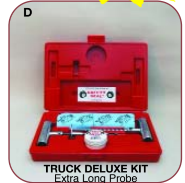
TRUCK DELUXE KIT Extra Long Probe