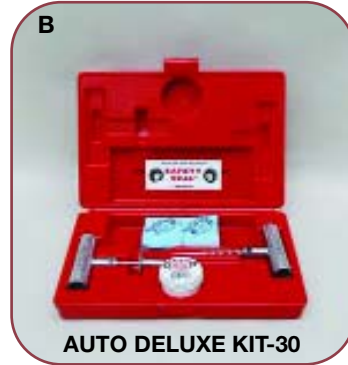
AUTO DELUXE KIT-30