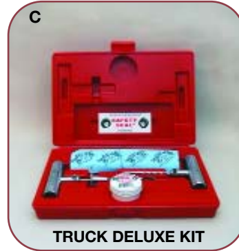
TRUCK DELUXE KIT