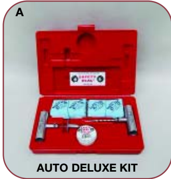
AUTO DELUXE KIT